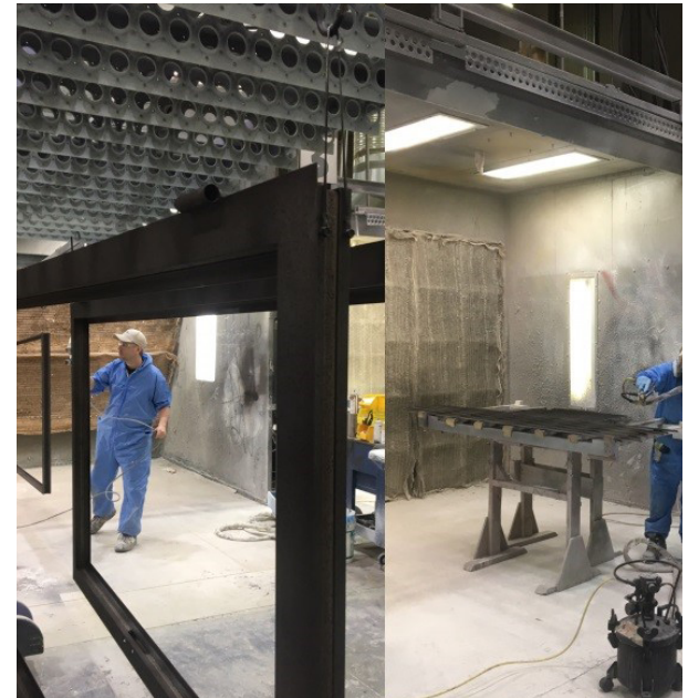
BRONZE COATING IN THE FACTORY

The right sealer coats can be hand-applied on site after cleaning the Bronze surface as part of an established maintenance regime. It's not a technically demanding feat of alchemy and you won't need a team of mad scientists in tin foil hats.